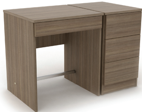
SPD-42-3 Split Desk 42" shown with three pedestal and one kneespace drawer