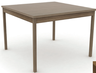
Wood Legs with Apron shown with Double Contour Wood Edge**

Standard edge color is black 3mm flat PVC, center pedestal tables are available with 3mm flat PVC edge or double contour edge. Contact your rep for available color match edge options.