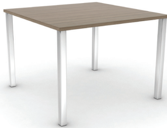
Silver Metal Legs

Standard edge color is black 3mm flat PVC, center pedestal tables are available with 3mm flat PVC edge or double contour edge. Contact your rep for available color match edge options.