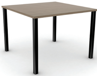
Black Metal Legs