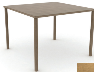
Wood Legs Attached with Steel Plate***