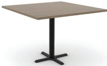
Cast Iron Pedestal Base