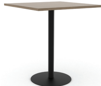
Bar Height with Cast Iron Disc Base