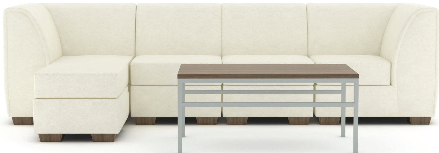
SAN ANTONIO – CHASE ADDITION