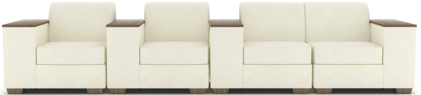
SAN ANTONIO – SIDE ARM