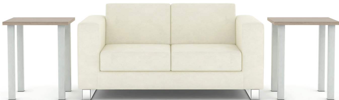
PHILADELPHIA – SLED BASE