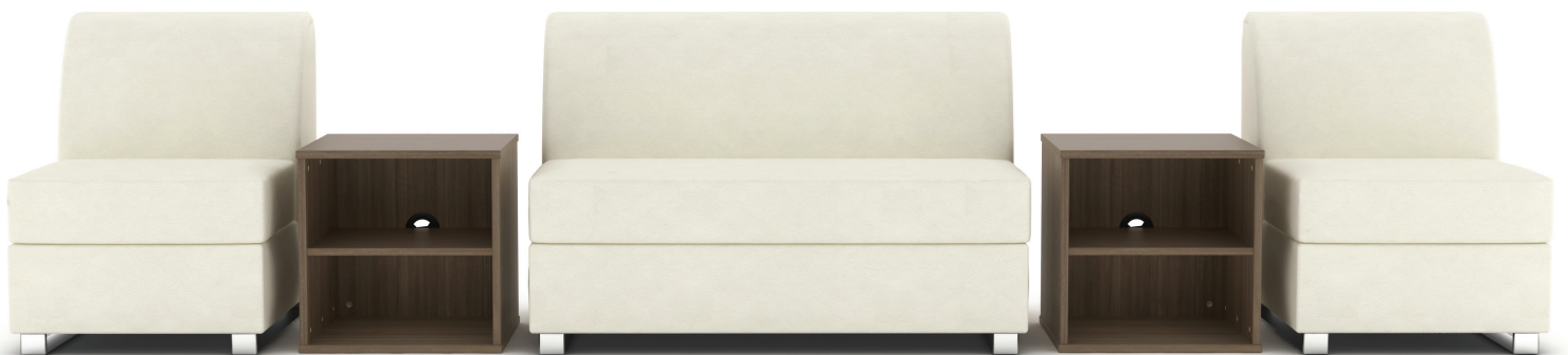
SAN ANTONIO – SLED BASE