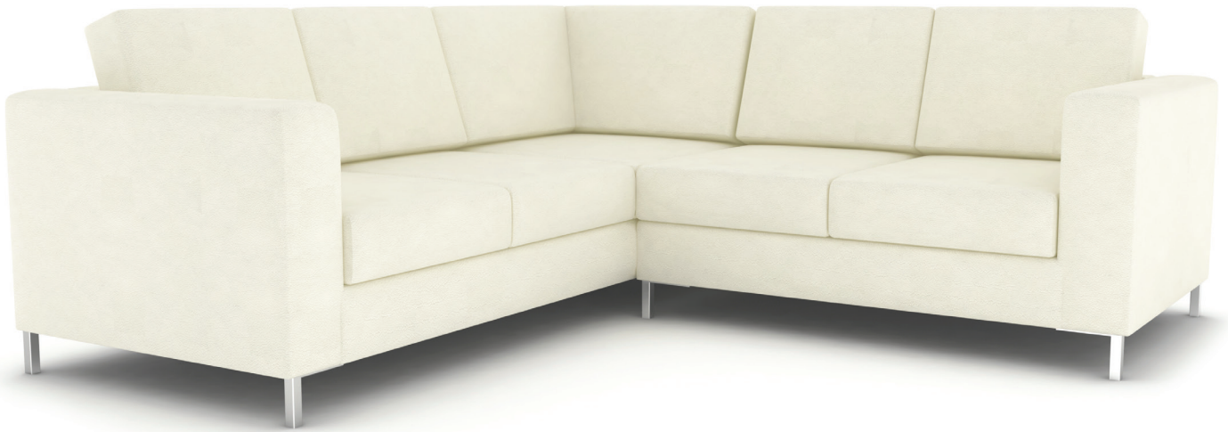
CLEMSON – METAL LEG