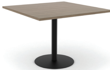
Cast Iron Disc Base*