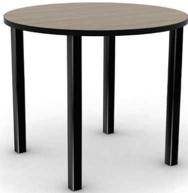
Black Metal Legs*