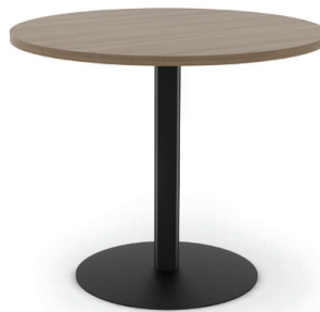
Cast Iron Disc Base*