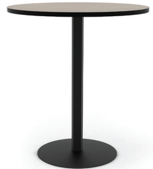
Bar Height with Cast Iron Disc Base*