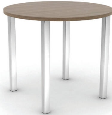
Silver Metal Legs*