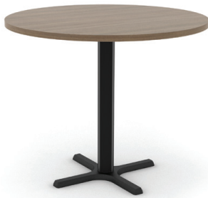
Cast Iron Pedestal Base*