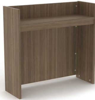
TDC-30 Tall Desk Carrel 30"