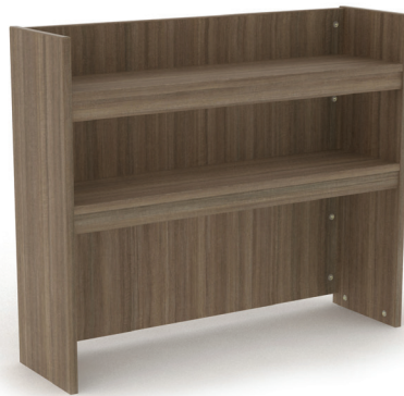
TSC-36 Tall Shelf Carrel 36"