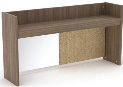
DC-42 Desk Carrel 42" shown with dry erase and bulletin boards