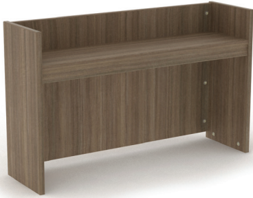
DC-36 Desk Carrel 36"